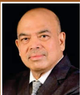
Shri S.K. Pattnaik. I.A.S (Retd.) Former Secy. DAFW, Govt. of India