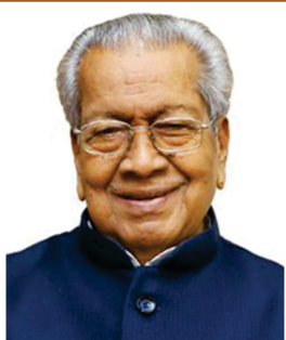
Shri Biswa Bhusan Harichandan Former Governor of Chhatisgarh